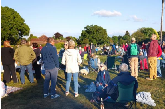
A chance to chat in the evening sunshine.