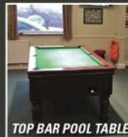
TOP BAR POOL TABLE