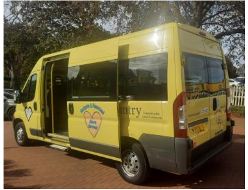
Photos from the recent GNS Tea Party in October