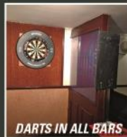
DARTS IN ALL BARS