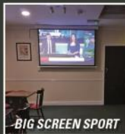
BIG SCREEN SPORT