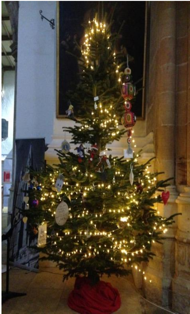
The Community Tree at St James

In all we do, we seek to live out Jesus' command to draw close to the love of God in worship, and to share this by loving our neighbour