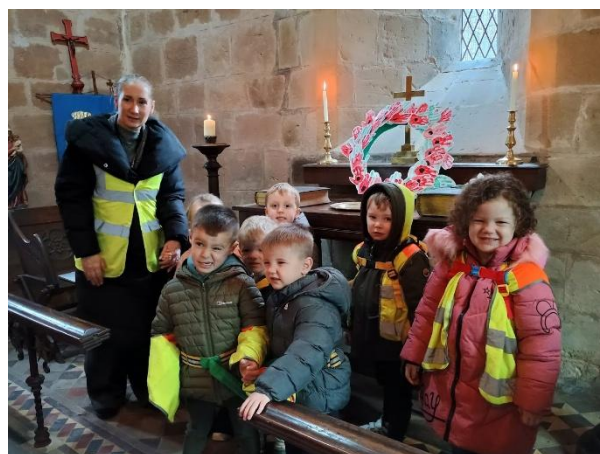
Chipmunks Nursery Act of Remembrance