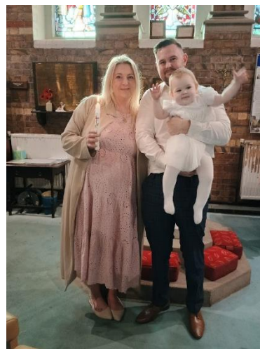
One of our baptism families at St John's this year

We have had regular cleaning days in church and one at the church hall, and appreciate all of the help in getting our church spick and span.