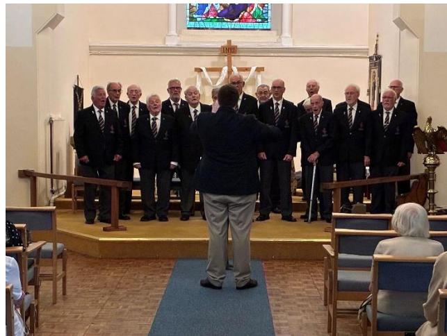
Shifnal Male Voice choir concert at St Leonard's in June