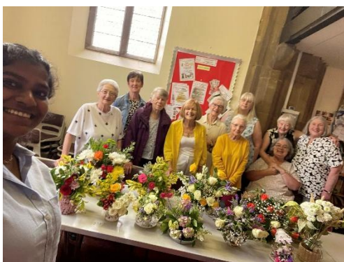
All Friends Together – flower arranging