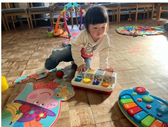
Fun at Baby Babble

This group is run by Great Dawley Town Council and they meet on the last Tuesday of each month from approximately 13.00-15.00. It has now been running for three years. Recently there have been twenty adults with twenty little ones attending most sessions. Light refreshments are provided for all – tea, toast and fruit. The adults have time for chatting and there are activities for the little ones e.g. music activities from an outside provider, talks on childcare and Baby Bank which helps to provide help with things like clothing etc. for those less able to buy them.