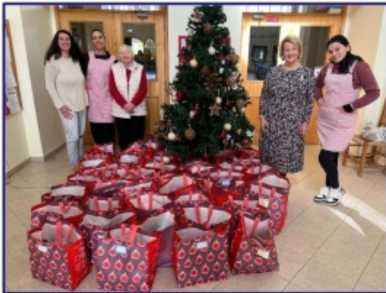
Christmas present distribution