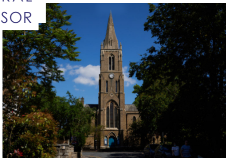
Parish Church of All Saints Frances Road SL4 1HU