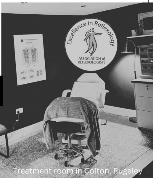
Treatment room in Colton, Rugeley