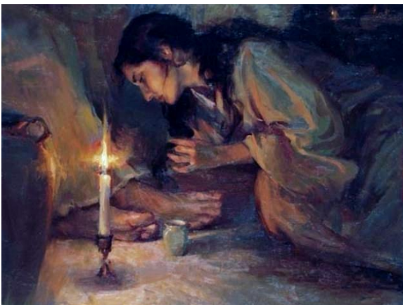
Jesus is anointed by Mary at Bethany

Almighty God, in Christ you make all things new: Transform the poverty of our nature by the riches of your grace, and in the renewal of our lives make known your heavenly glory; through Jesus Christ our Lord. Amen