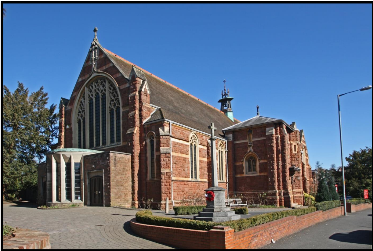
St Martins Church, London Road.

From St Philip & St James' Church, Whittington, we retrace our steps a short way by following the A4440 back towards the city centre, but at Whittington Road we continue along the road as it becomes London Road and then down the hill to St Martin's Church.