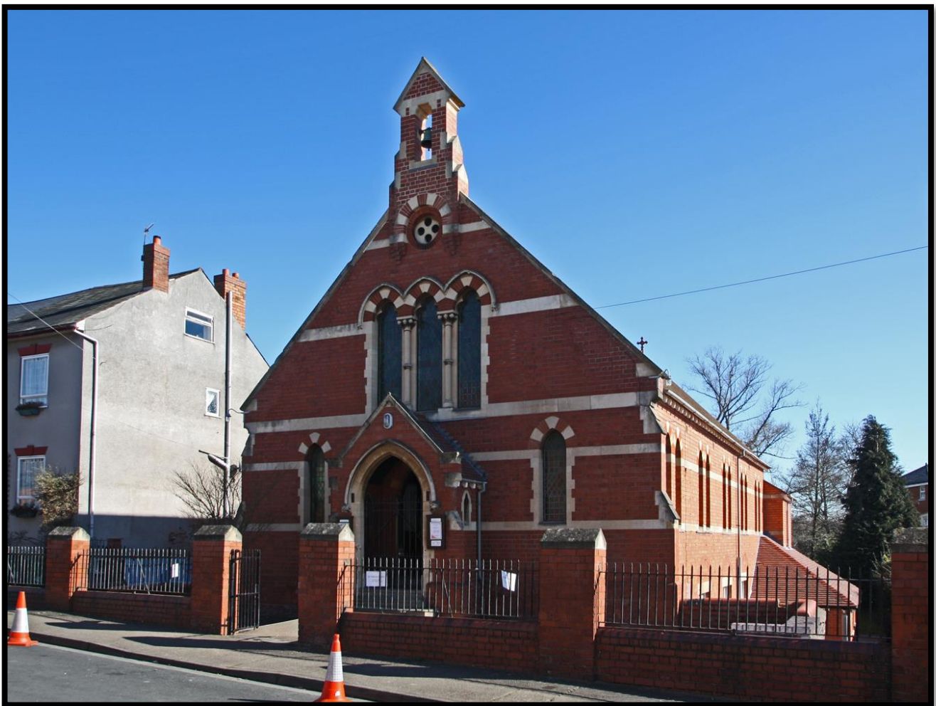
St Marks in the Cherry Orchard Church.

Walking from St John's Church, we follow the ancient route along Slingpool Walk and then meander past Chapter Meadows and along the river to the foot bridge at Diglis. After crossing the river we walk through Cherry Tree Nature Reserve before arriving at St Mark's in the Cherry Orchard.