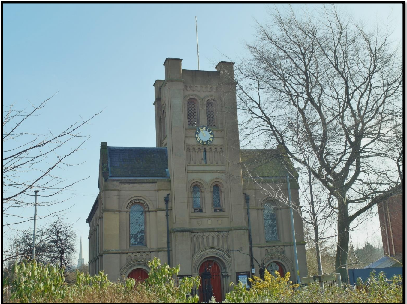
St Clements Church.

At the Cathedral, we will say 'Prayer During the Day' at 12noon, in the Crypt.