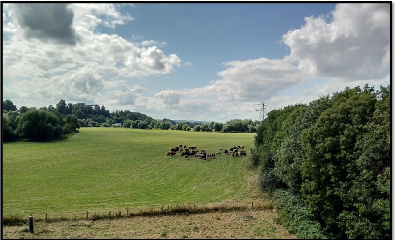
Fields from footbridge.

We head back to Worcester following the roads back to Powick Bridge. Immediately after the bridge we take the road on the left and follow the path through the fields to Wick Episcopi and then at Upper Wick we cross over the A4440 using the footbridge before following the footpath across the Boughton Park Golf Course. From Swinton Lane we head to St John's Church for Evening Prayer.