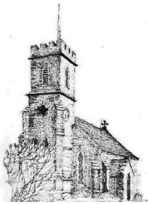
St. Philip & St. James Church, Groby