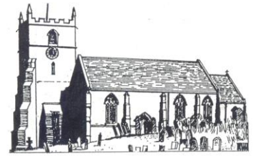
St. Philip & St. James Church, Ratby