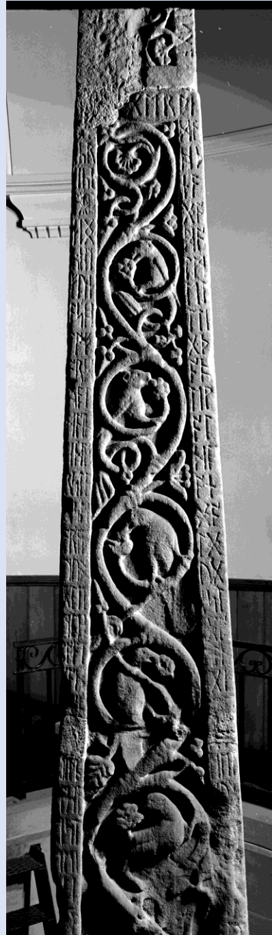
Ruthwell Cross, north side

+ Almighty God stripped himself when he wished to mount the gallows, brave in the sight of all men. I dared not bow. I [raised aloft] a powerful king. The Lord of heaven. I dared not tilt. Men insulted the pair of us together. I was drenched with blood [begotten from that man's side].