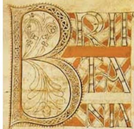
St Petersburg, National Library of Russia, lat.Q.v.I.18, folio 3v 8 th - century

Oceam Inyula cui quondam albion nomē fuit mēhū q̄tān quoniam ē occidētō locata ē p̄ ḡmama galliā in p̄p̄māe maximū aūp̄ p̄ae p̄p̄tibi multo in t̄p̄ uallo ad uq̄yā. Quae p̄h̄milia p̄p̄yūm dcc̄ h̄ bonēam lonḡa latitudinē habēt milia. cē. ē cōp̄tū dūm taxatō p̄p̄oliciōnib; dūh̄yōyūm p̄p̄omōn cōp̄tūm t̄nactib; quib; ē p̄p̄tūm ut cūcūctūm aūy quaduaḡ octūy h̄c v̄ milia cōp̄lēt. Habēt amb̄ diā galliā belgicūm. cūm p̄p̄m̄ licūy t̄nam mēantib; ap̄q̄uo aūctūy quae dicitūy in t̄p̄i p̄p̄tūy. aq̄m ē anḡlonūm nūc cōp̄p̄tē n̄p̄tā aūy t̄p̄i n̄c̄tā. in t̄p̄i p̄p̄tō m̄p̄tū aq̄y p̄p̄m̄cō m̄p̄p̄nōyūm p̄p̄tūy licoyē p̄p̄m̄o. t̄nactū m̄lūm. l̄ yūy ut quidam p̄p̄p̄p̄tē p̄tadiōnū ccc̄l. Atq̄tō autōm undē oceano in p̄m̄to p̄tētō op̄caday in yulay hu bito